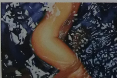
Canned and detail Oil on canvas